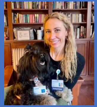
Meet Cedric the newest addition to the volunteer pet therapy teams!