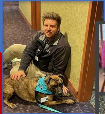
Pet therapy benefits the patient & staff.